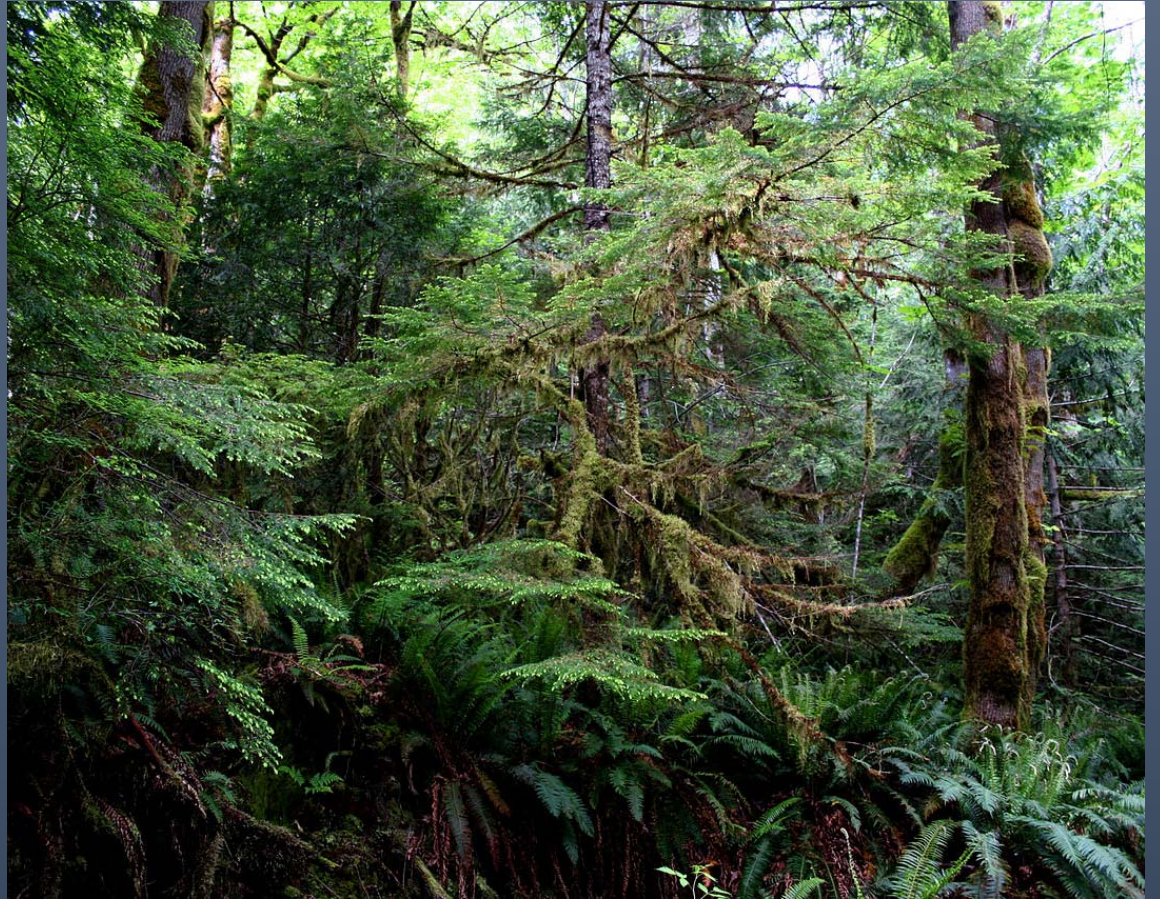
This is the forest floor

The first layer is called the forest floor it is very dark. Things decay very fast down there.