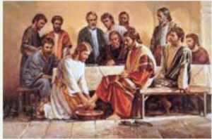
Washing the disciples feet