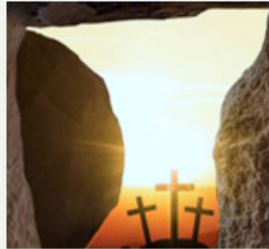
The Last Supper and the Eucharist