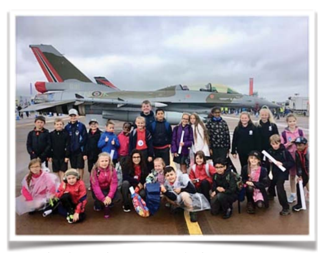
Red Oaks pupils visiting Fairford Air Tattoo

As our Trust grows, there are now many more results that demonstrate the fantastic achievement of our pupils, covering all ages from Key Stage 1 right through to 'A' levels and university entrance.