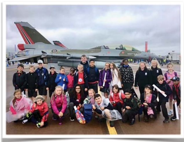
Red Oaks pupils visiting Fairford Air Tattoo

As our Trust grows, there are now many more results that demonstrate the fantastic achievement of our pupils, covering all ages from Key Stage 1 right through to 'A' levels and university entrance.